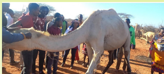
Camel health peer-to-peer learning.